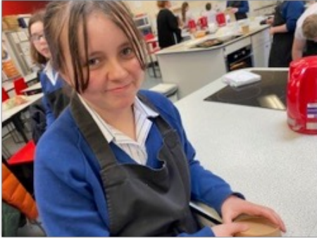
Taking part in cooking lessons

This years Horizon group have been developing Character and life skills through a range of activities across the year