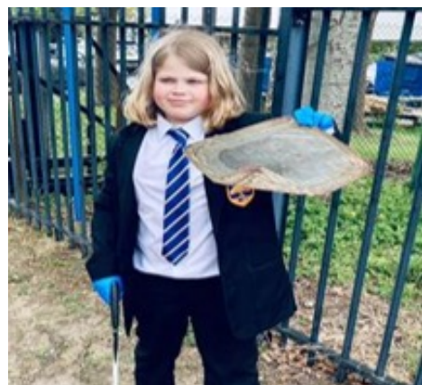
Community Litter pick