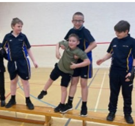
Team building In PE