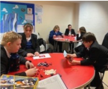
Lego therapy in Action

The group completed a litter pick around the local area as they wanted to show the pride in our local community, in just a short afternoon they collected 5 bags of rubbish